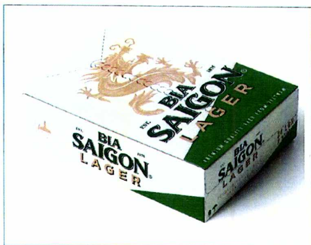
24 Can carton